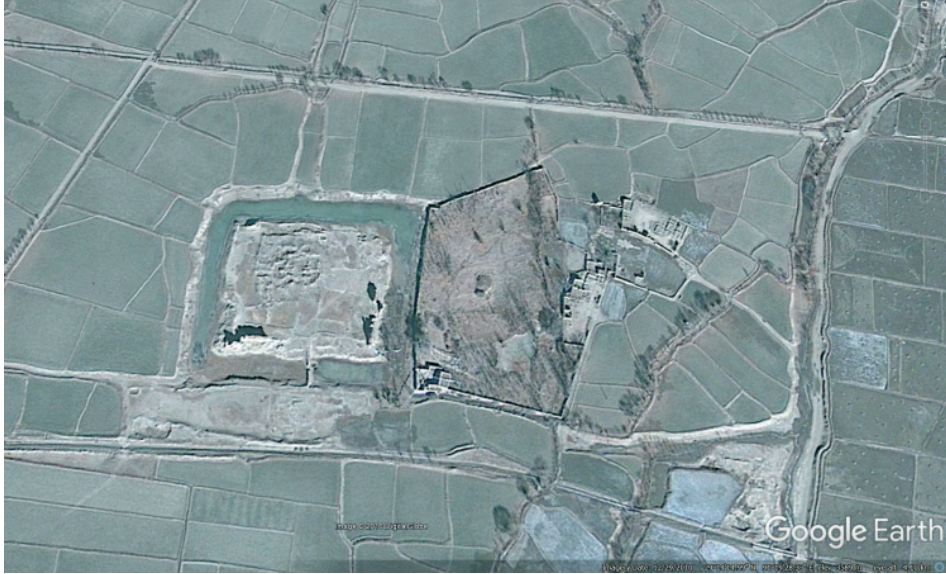
Fig. 5: Satellite image showing the ruins of Dar rgyas gling estate, southwest of Grwa thang monastery (based on Google Earth; Satellite photo 12/2010, Digital Globe).