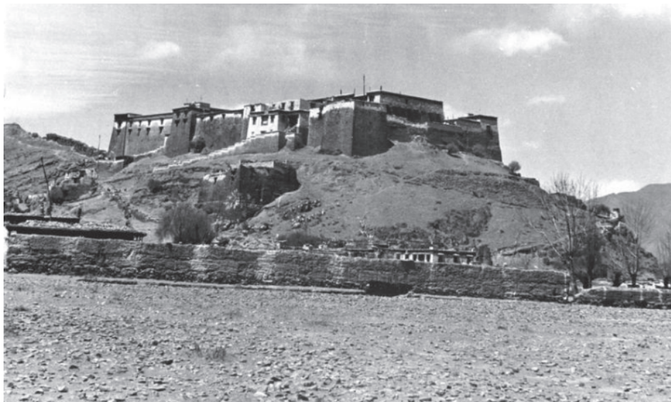
Fig. 3: Gong dkar Fortress at Lower sKyid shod (Photo: Ernst Schäfer, April 1939; German Federal Archive, Bild 135-S-15-24-12). The original caption mistakenly reads “Tschitischio” (ICe bde zhol).

dBus Province. 18 Was he, the early-deceased father of Byams pa gling pa, the first official under the Phag mo gru pa to become the ruler of what constituted Yar rgyab in the late fourteenth or early fifteenth century? In any case, it seems that the Yar rgyab pa became firmly established in southern dBus during the reign of Gong ma Grags pa rgyal mtshan (r. 1385–1432). Byang chub nram rgyal depicts a close relation with the Phag mo gru pa government during the rule of the fifth gong ma , who entrusted three of rDor bkraś du dben sha’s sons with high administrative positions and land estates to the west of sNe gdong, comprising the valleys of Grwa, Dol, gZhung and Gong dkar. 19 These fertile valleys on the southern gTsang po side, which