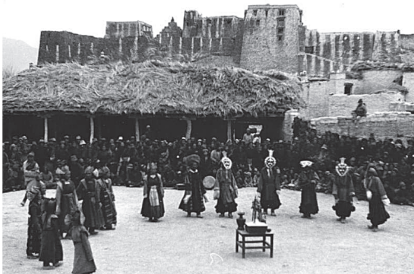
Fig. 6: Ache Lhamo dancers performing in front of the ruined fortress at lCe bde zhol in the lower Dol valley. The old fortress seems to be the former site of the lHun grub lha rtse estate of the Yar rgyab pa (Photo: Ernst Schäfer, April 1939; German Federal Archive, Bild 135-S-15-25-16).